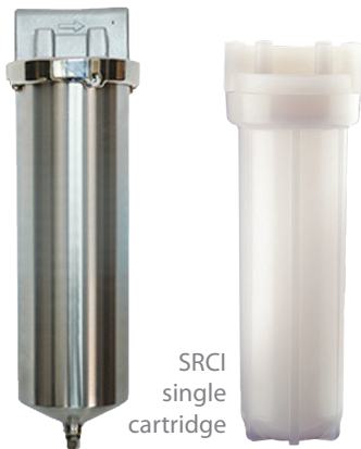
SRC single cartridge

With a radial seal, the SRC has a machined surface that produces a positive seal to eliminate bypass. The SRC vessel line is raising the bar in the Original Equipment Manufacture market by delivering superior value in a cost-effective design.